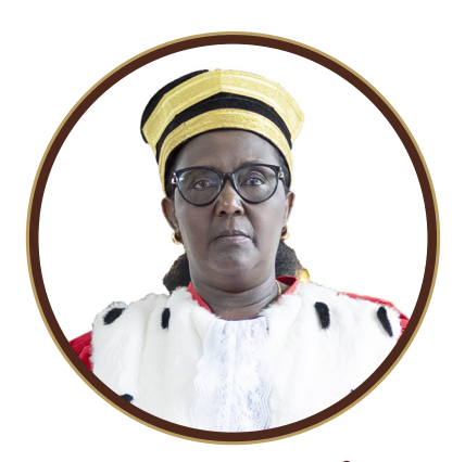
Rt. Hon. Justice MUKANTAGANZWA Domitilla